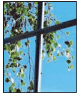
Picture taken in Ukraine through bars of a prison.